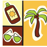
Make a collage