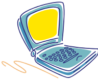
Start a YouTube channel