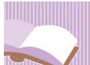
Self-publish a book