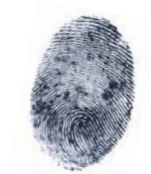
Make your Fingerprints